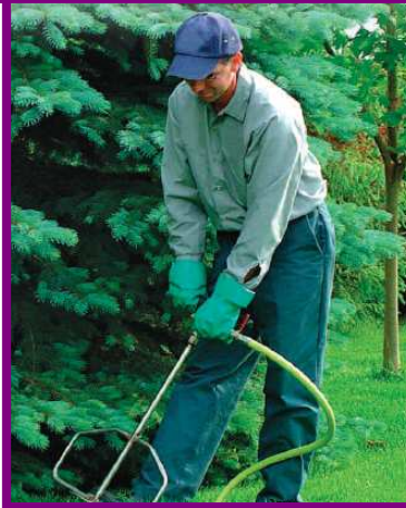
Deep Root Fertilization puts nutrients into the root zone

Dormant oil is a spray that combats insects by coating them in an oily residue. The oil blocks an insect's ability to breath.